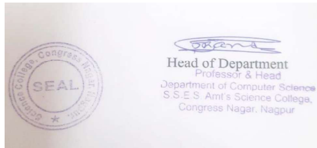
Signature of Teacher